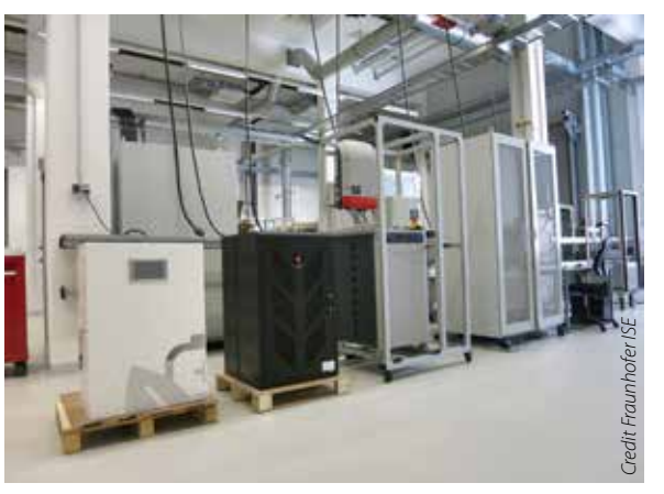
Figure 1. Storage systems under test at Fraunhofer ISE

In the joint research project 'Safety First', Fraunhofer ISE is partnering with the Karlsruhe Institute for Technology (KIT) and the Centre for Solar Energy and Hydrogen Research (ZSW) to investigate the