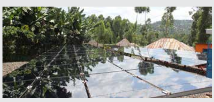
Powerhive has used its technology to start gathering potentially invaluable data on customer power consumption habits.

Wuts says: "We have a huge amount of data that very few people in