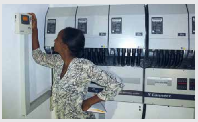
Phaesun's solar-plus-storage system helped bring reliable power supply to a hospital in Eritrea.

According to Phaesun, the Off-Grid Connect System helps bridge power blackouts with a bank of OPzV lead acid batteries that offers 124kWh storage capacity. This is additionally solar fed with a 14.4kWp PV-generator consisting of 72 200W monocrystalline solar modules. For the power management, components from Swiss manufacturer Studer are used: three Studer VarioTrack 80 MPPT charge controllers, six inverter/chargers Studer XTH 8000 and a remote control guarantee a reliable energy management.